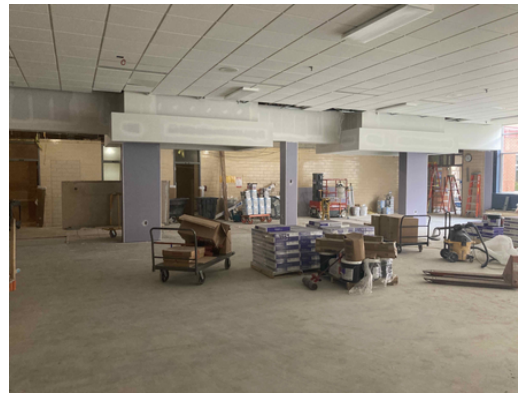
Middle School – Dishwasher Concrete Floor Poured Back In