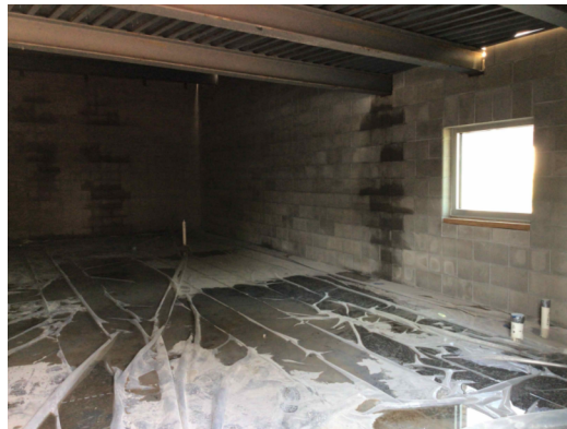
Sheridan Hills – Underground plumbing in the Kitchen.